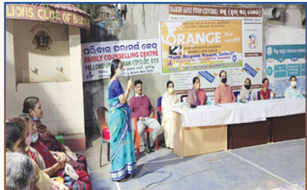
End Violence Against Women programme at our One Stop Centre