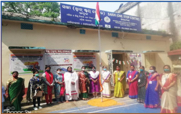
Observation of Independence Day at our OSC