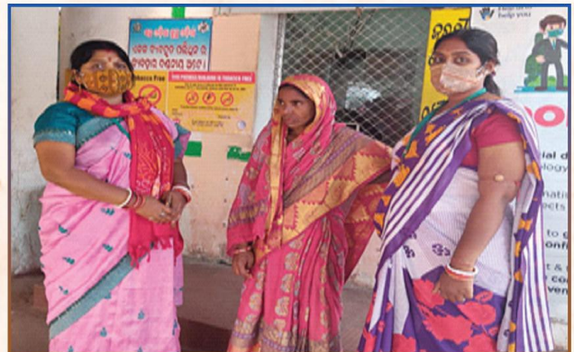
Medical assistance to the victim by our OSC staff at DHH, Bhadrak