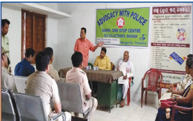
Advocacy with police programme at Bhadrak Rural police station