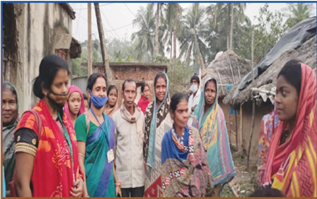
Home visit by One Stop Centre staffs for a domestic violence case