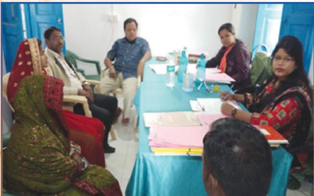
Counseling on the Domestic Violence at our Family Counseling Centre at S.P office, Bhadrak