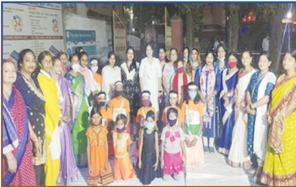
Programme on End Violence Against Women at our One Stop Centre