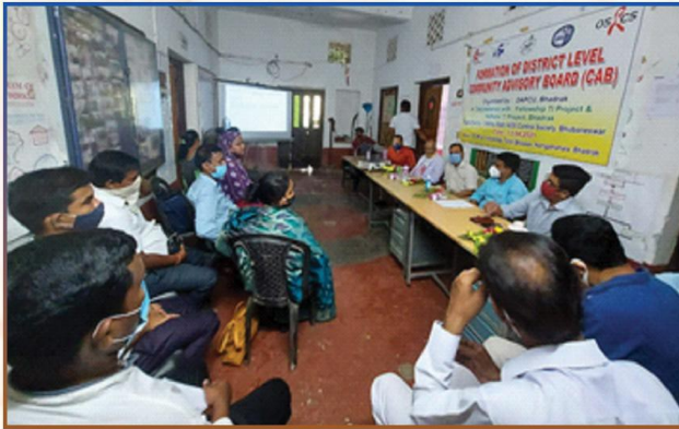
Community Advisory Board is reviewing the achievement of our T.I project