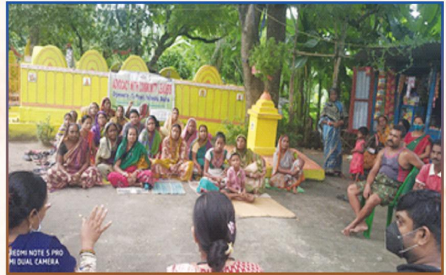
Hot spot meeting by our staffs at community level on T.I project