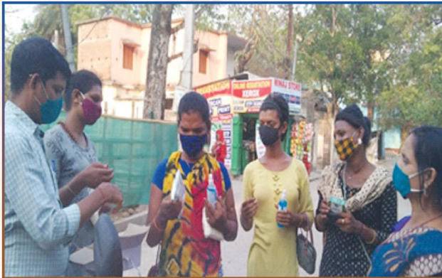
Distributing sanitizer to MTH community by our staffs.