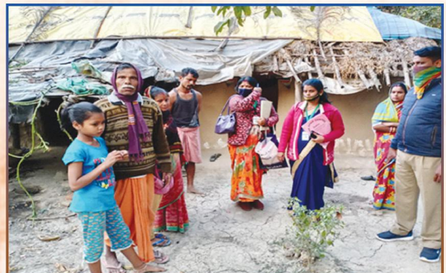
Home visit by OSC staffs along with police for a domestic violence case