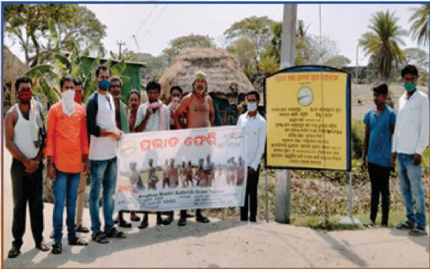
Prabhat Pheri on the Pradhan Mantri Adashra Gramya Yojana at Tihidi block