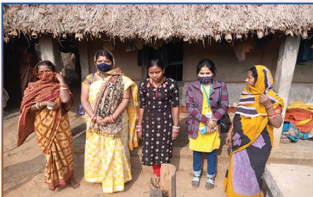
Rescue to the victim by One Stop Centre