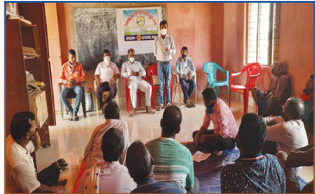
Village level meeting with VLC members for Pradhan Mantri Adarsha Gramya Yojana at Tihidi