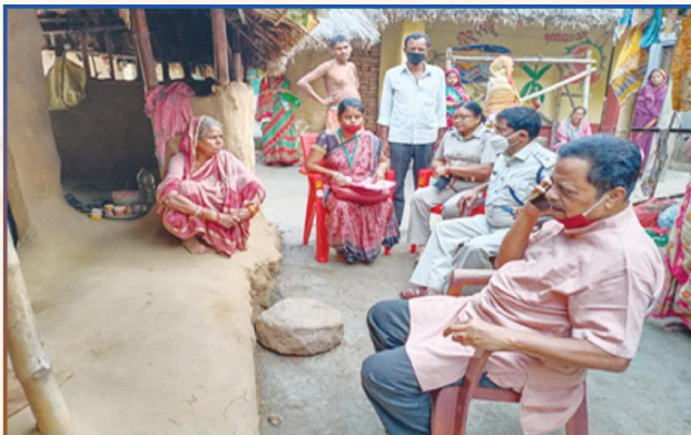
Spot visit to a victim's in-laws house by our Director with police for counseling