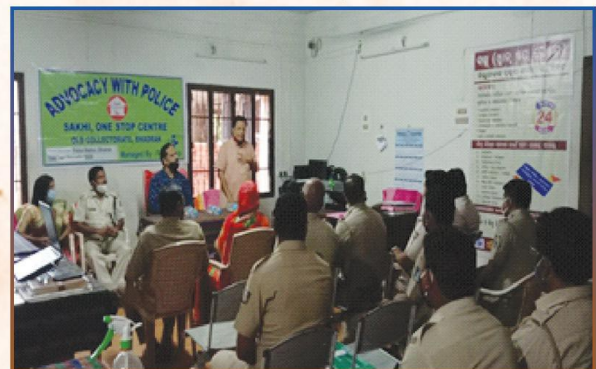
Advocacy with Police Programme at Dhamnagar Police Station