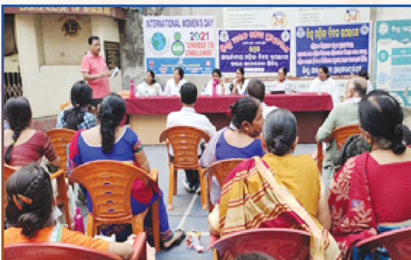
Celebration of International Women's Day at our One Stop Centre