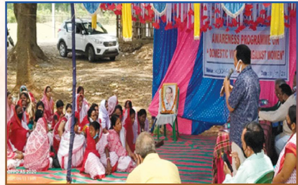
Programme on Kasturiba Gandhi Jayanti at Chandigaon