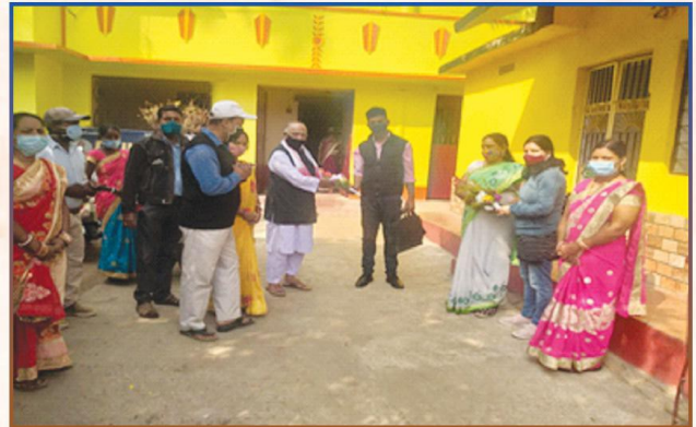
Inspection Team from Delhi visited our office on Targeted Intervention Project